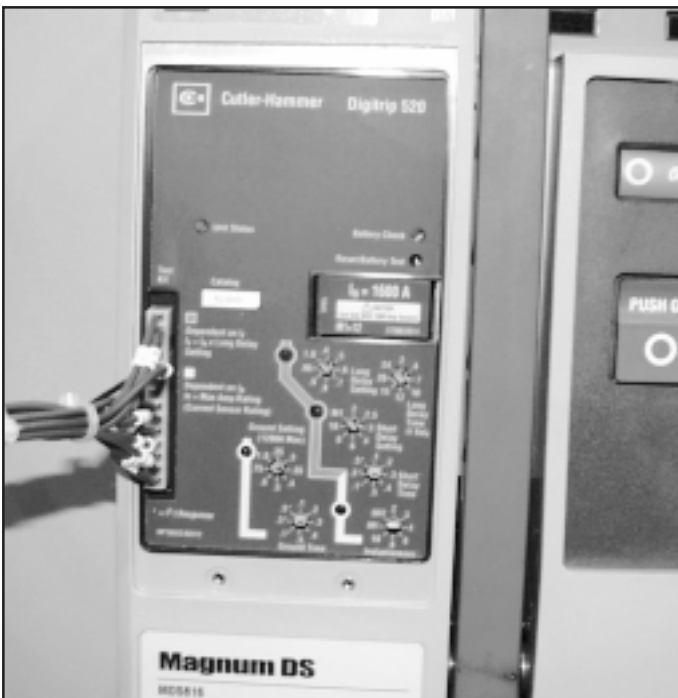
Figure 4. Trip Unit Face Plate Showing Test Port Connection