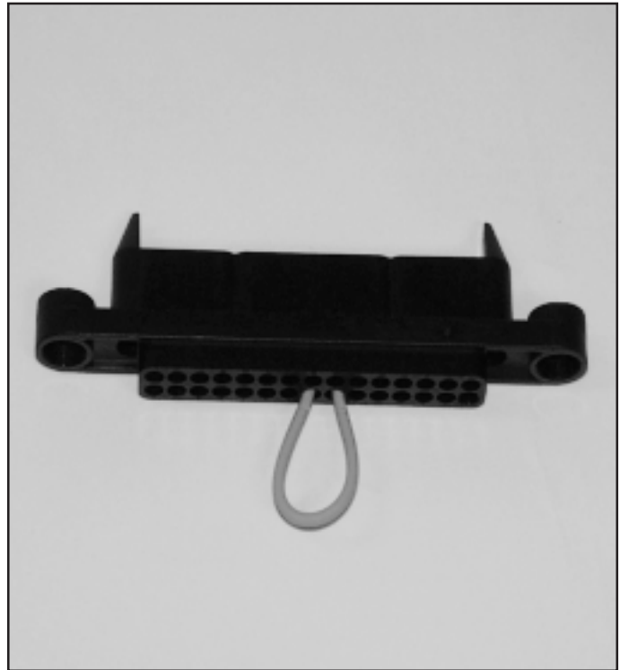
Figure 3. Zone Interlock Shorting Plug