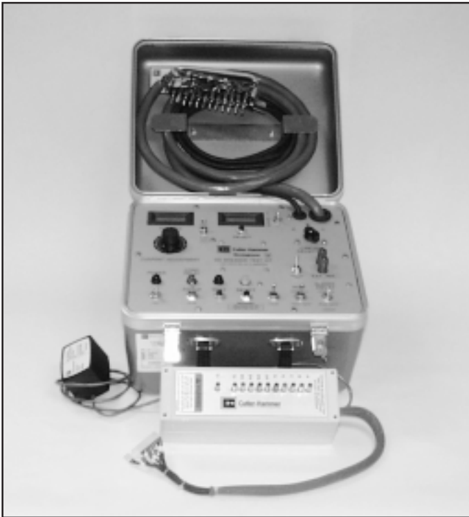
Figure 2. Test Kit and Adapter