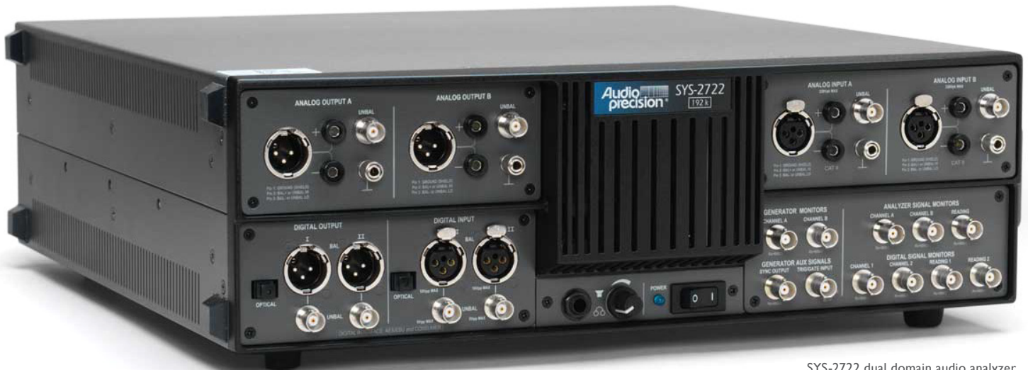
SYS-2722 dual domain audio analyzer

The highest performance audio analyzers in the world