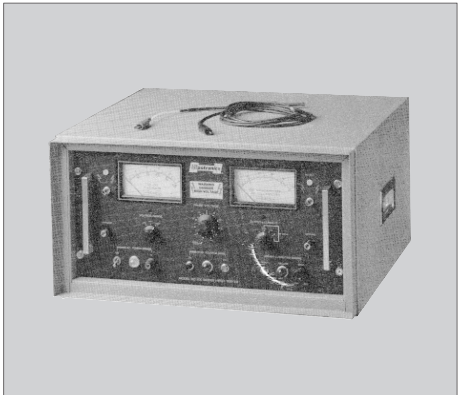
Model HD125 AC/DC Hipot Tester