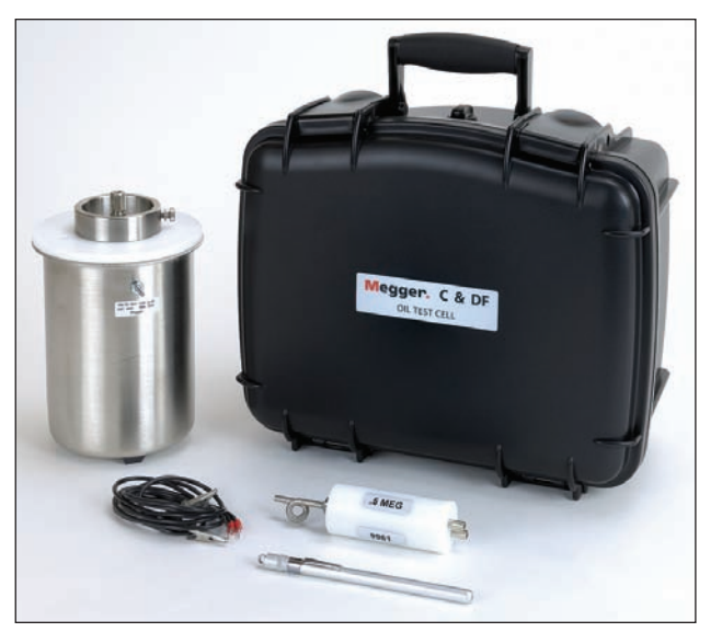
The optional Oil Test Cell, C/N 670511, is used for testing insulating fluids up to 10 kV \,