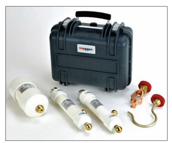
Optional capacitor kit includes carry case, TTR capacitor (left), and 2 reference capacitors (center). Also shown are 2 connectors (right) that will work with the capacitors and are supplied with the DELTA2000 unit