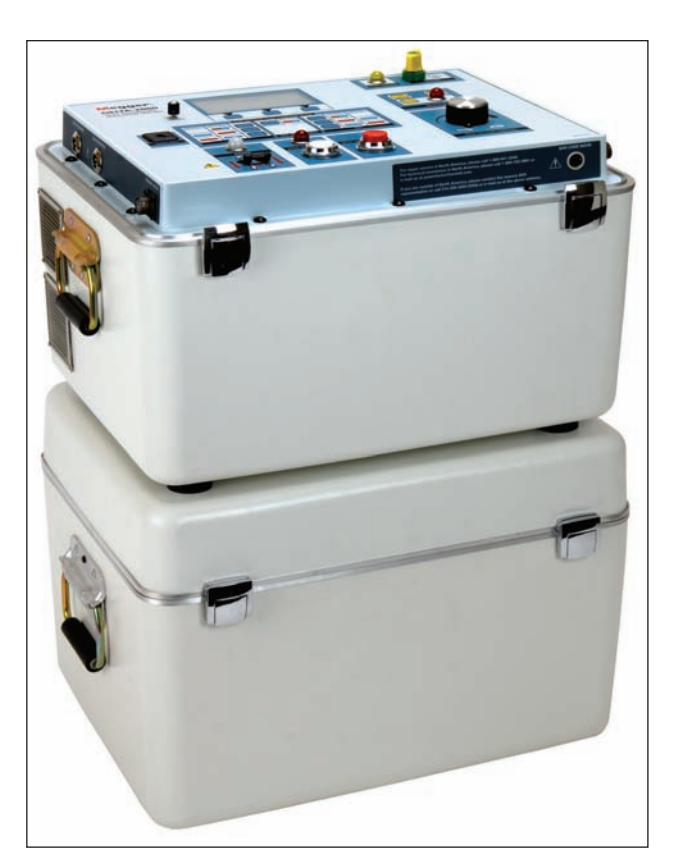
The DELTA2000, available in either 120 or 240 V ac/50 or 60 Hz, includes the Control Unit (top) and High Voltage Unit (bottom)