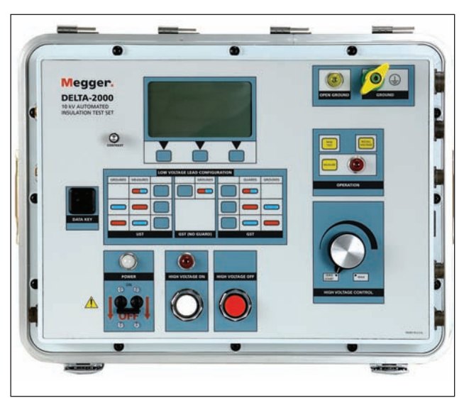
Close-up of DELTA2000 panel