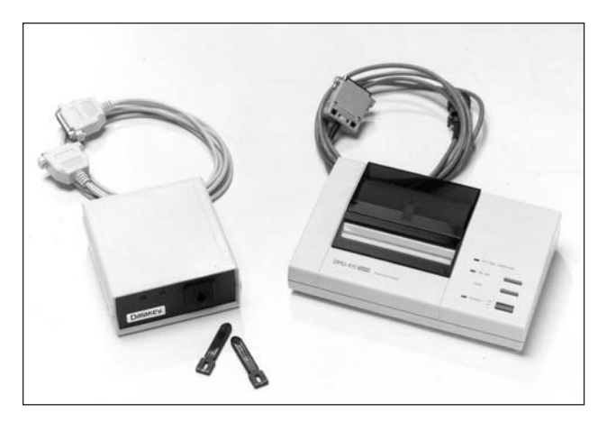
Data Keys with PC interface box and standard thermal printer

Control Unit: 74 lb (33kg) High Voltage unit: 63 lb (29 kg) Cables: 35 lb (16 kg)