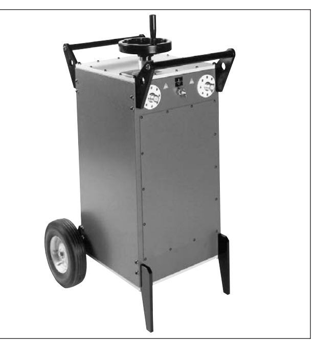
The optional Resonating Inductor expands the capacitance range of the DELTA2000