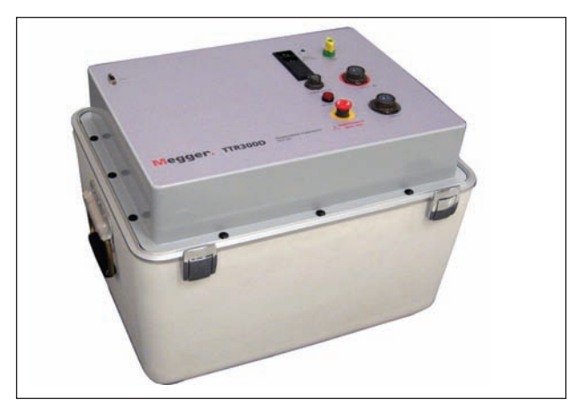
Optional TTR300D module, for LV three-phase TTR testing, installed inside DELTA HV cabinet. (Lid not shown for clarity.) Via PowerDB software, TTR testing is in accordance with Megger TTR300 product specifications. External laptop is easily placed on top surface of module for added convenience.