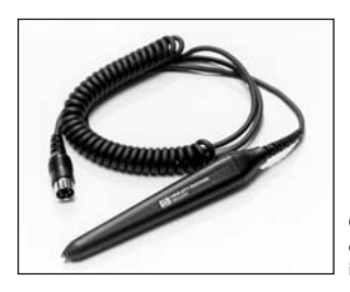
Optional bar code wand for recording an alphanumeric test identification