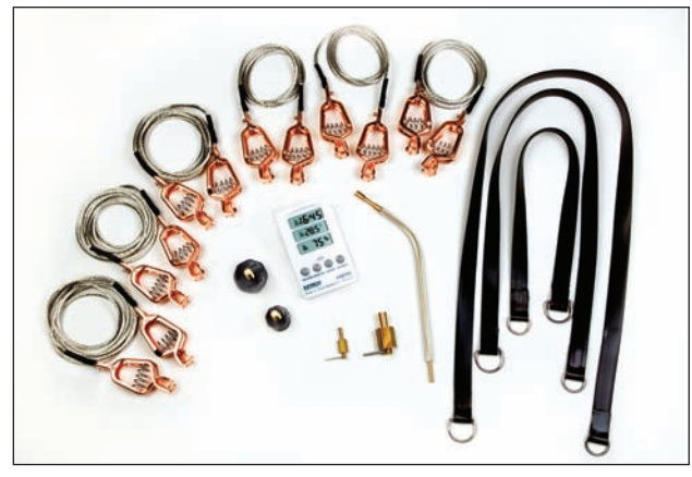
The optional accessory kit, C/N 670501 includes mini bushing tap connectors, hot collar straps, temperature/humidity meter, .75" bushing tap connector, 1" bushing tap connector, "J" probe bushing tap connector, 3-ft non-insulating shorting leads, 6-ft non-insulating shorting leads