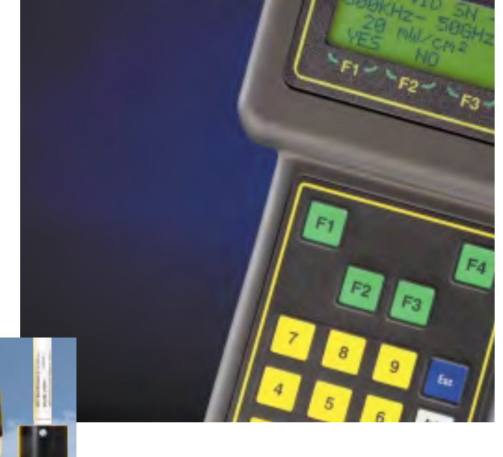
Precision Measurement Technology for Safety in Electromagnetic Fields