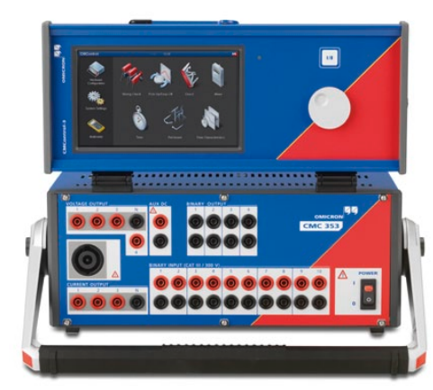
CMC 353 with CMControl-3 Front Panel Control (option)

Besides its operation with the powerful Test Universe software running on a PC, the CMC 353 can also manually be controlled with the highly flexible CMControl unit.