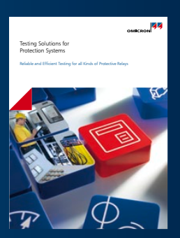
Testing Solutions for Protection Systems

For a complete list of available literature please visit our website.