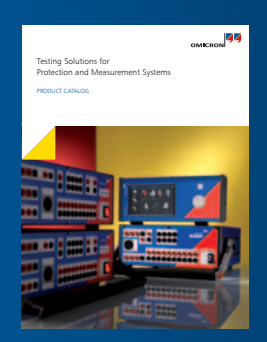
Product catalog (secondary equipment)

The following publications provide detailed information on the products described in this brochure and their applications: