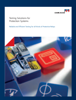
Testing Solutions for Protection Systems

For a complete list of available literature please visit our website.