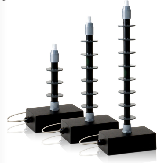
HVL Series High Performance Lab Grade, HV-SmartProbes<sup>™</sup> shown above in 35KV, 70KV and 100KV models. HVP Series portable HV-SmartProbes<sup>™</sup> are available in 35KV and 70KV models and include probe stands for bench use.

The HV-SmartProbe's<sup>™</sup> proprietary, ultra low TC attenuator design eliminates voltage coefficient adders - while its reduced capacitive construction technology enhances AC performance. In addition to the direct input terminal the 4700 has two probe inputs - one probe to extend your measurement range or two probes for making high voltage differential measurements.