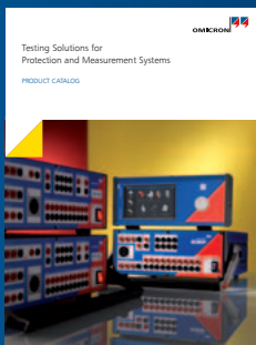
Product catalog (secondary equipment)

The following publications provide detailed information on the products described in this brochure and their applications: