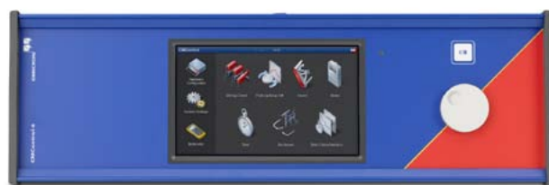
CMControl-6 Front Panel Control (option)

Besides its operation with the powerful Test Universe software running on a PC, the CMC 356 can also manually be controlled with the highly flexible CMControl unit .