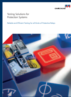
Testing Solutions for Protection Systems

For a complete list of available literature please visit our website.