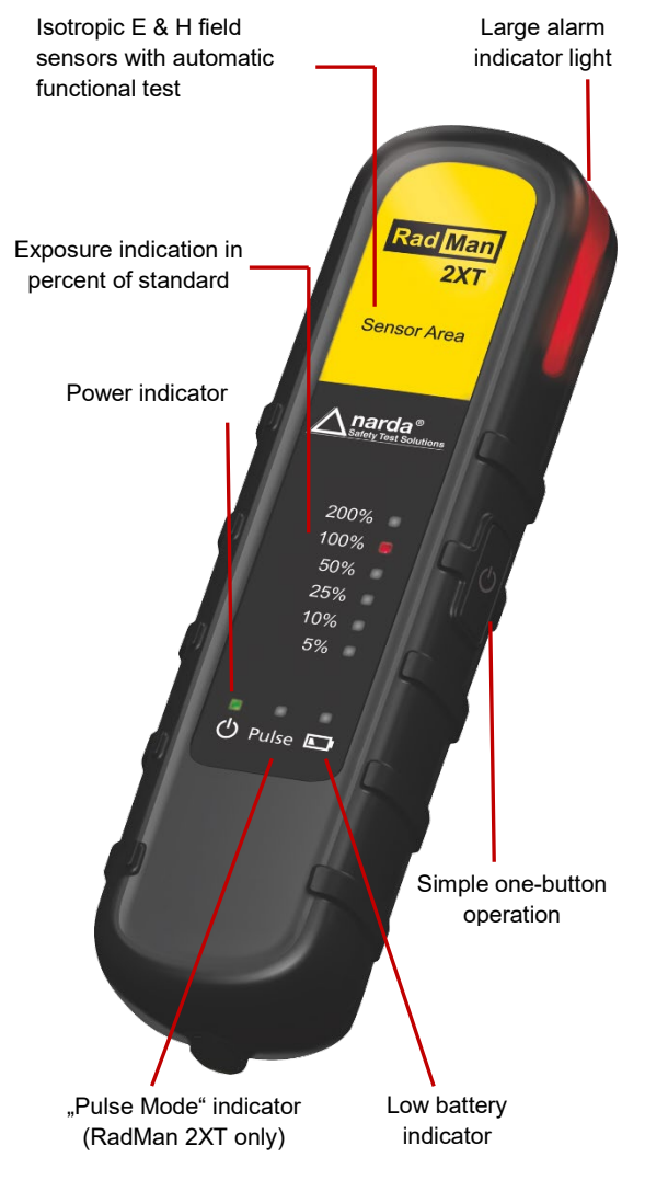
Fig. 1. Front view with controls and indicators

The actual field exposure level is indicated in six steps from 5% to 200% by LEDs. The percentages refer to the proportion of the power density limit value specified in a safety standard. If the field exposure level exceeds 50% of the limit value, the device vibrates and emits a loud alarm tone. There is also a bright light in the top part of the RadMan 2 that can be easily seen from various angles. The light flashes red in time with the alarm signal. A second, more persistent alarm sounds when the 100% threshold is exceeded, warning the user to leave the danger area. Device versions with alarm thresholds that can be set using PC software are also available.