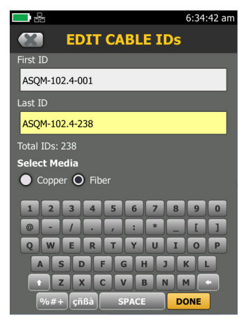
A full keyboard for faster data entry than

Investing in Versiv means you'll also be ready to take on new jobs. Versiv supports future measurements such as TCL and resistance unbalance that your DTX never will. Certify coax and standard or industrial Ethernet patch cords in both directions. Test singlemode fibers that are more than ten times as long. And the modular design means you can add new capabilities without buying a new tester.