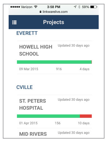
Track the status of jobs from smart devices