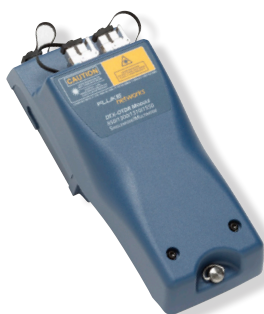
DTX Compact OTDR module