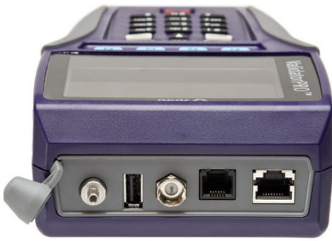
Test fiber and copper (telco, network &amp; coax) cables

The ValidatorPRO includes an integrated optical power meter that measures optical power at 850/1300/1310/1490/1550 nm on multimode or single-mode fiber to address an increasing number of Ethernet networks that now include optical links.