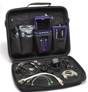
ValidatorPRO NT1150 ValidatorPRO-NT NT1155