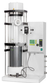
Nano Spray Dryer B-90 HP Spray Dryer for small samples and particles