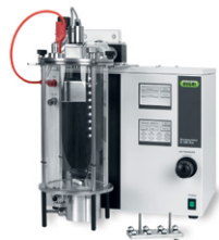
Encapsulator B-390 / B-395 Pro Gentle bead and capsule production