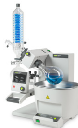
Rotavapor® R-300 Convenient and efficient rotary evaporation