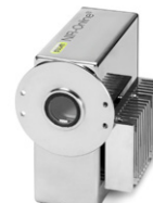
NIR-Online® Production quality control in real time