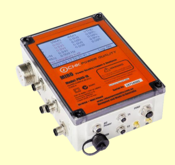
Figure 1: MIRO PQ45-1k Three phase power quality logger and analyzer