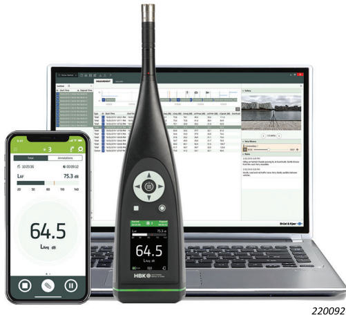
Fig. 1 The complete solution: HBK 2255 Sound Level Meter and the Noise Partner app installed on a mobile device and PC

HBK 2255 Sound Level Meter is a complete package solution that includes the Noise Partner app for both mobile measurement control, display and data transfer and as a PC-based application for analysis and documentation.