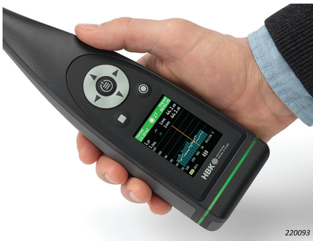
Fig. 2 The sound level meter's lightweight design and user-friendly display

HBK 2255 provides effortless usability with a dust- and water-resistant body that is rubberized for a more secure grip and ensured compliance to IP 54. The seven control buttons can be comfortably operated with one hand, and the instrument's clear, bright display shows you the most important information at a single glance. With a 13-hour battery life, you can be sure it will not let you down.