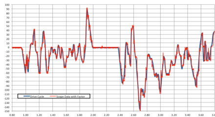
The 900 EX can run all standard drive cycle simulations, including FUDS, SFUDS, GSFUDS, DST, ECE-ISL, etc.