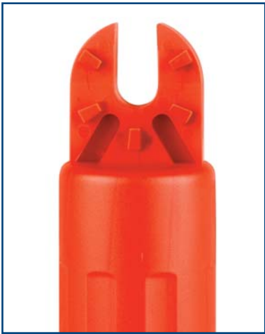
Universal spline for hot stick connection