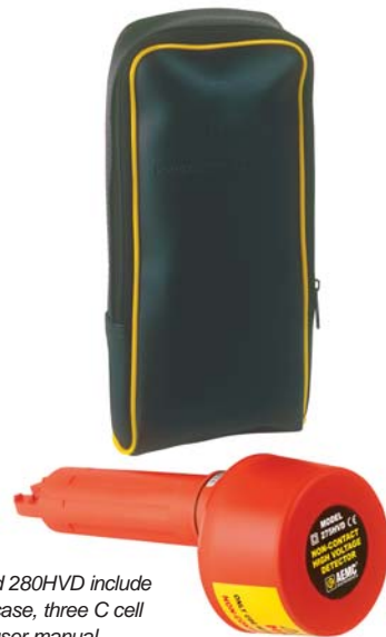
Models 275HVD and 280HVD include a padded carrying case, three C cell batteries and user manual.