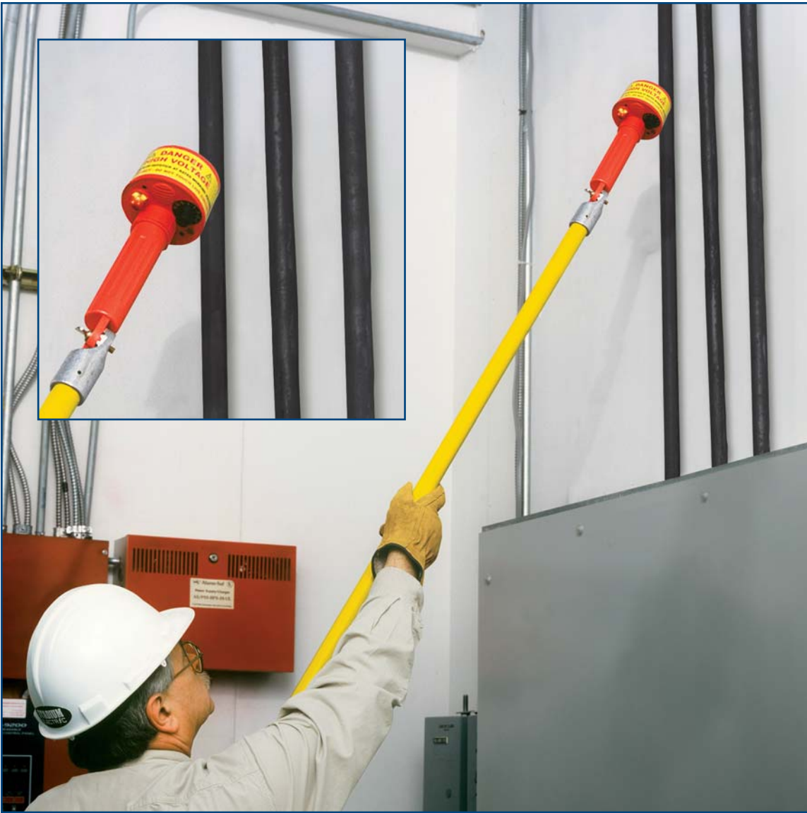
Model 275HVD checking for live voltage on main feeder