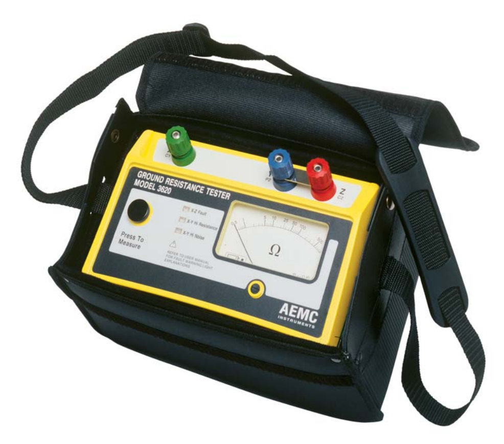
Model 3620 shown in standard soft carrying case Catalog #2114.90