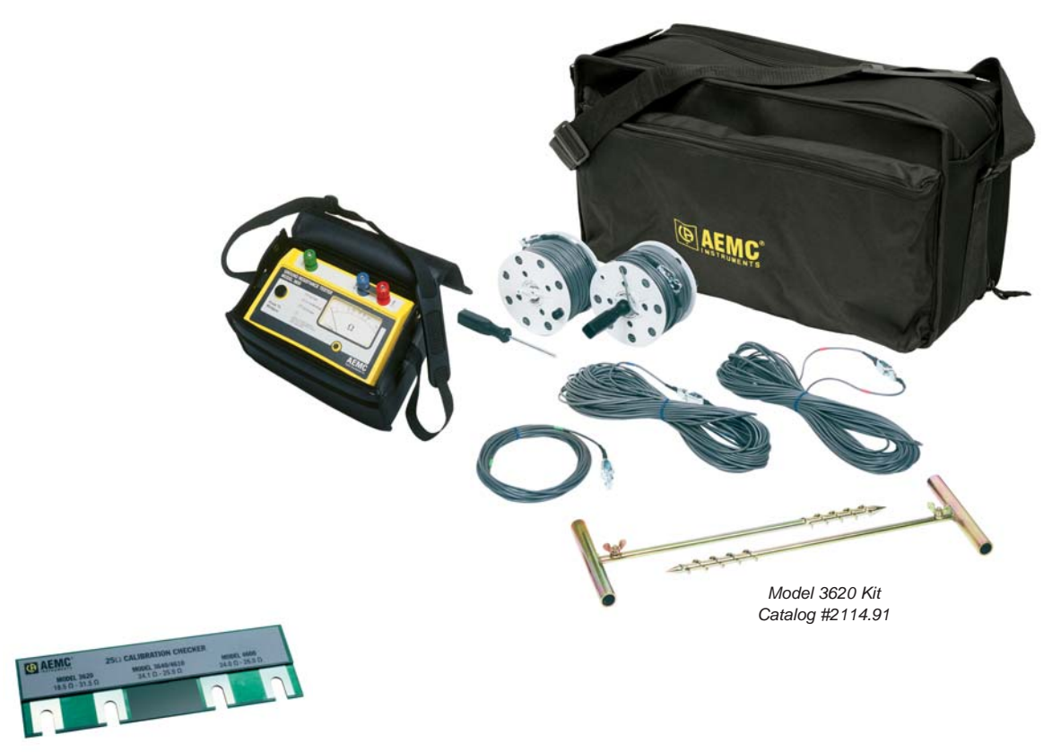
25\Omega Calibration Checker Catalog #2118.58