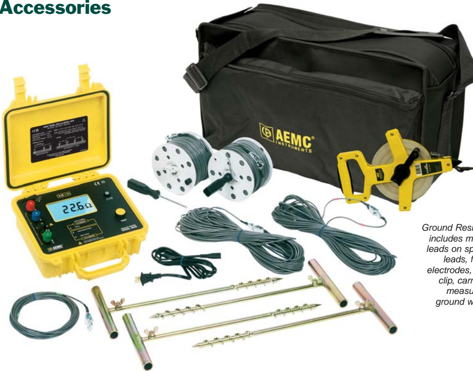
Ground Resistance Tester Model 4630 Kit includes meter, two 300 ft color-coded leads on spools, two 100 ft color-coded leads, four 16" auxiliary ground electrodes, one 16 ft lead with Mueller® clip, carrying bag, one 100 ft tape measure, one AC power cord, ground workbook and user manual