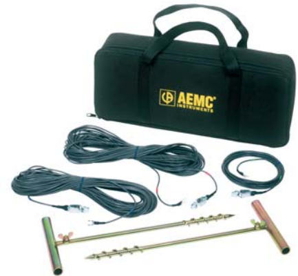
Ground Test Kit – 3-Point (supplemental 4-Point) includes carrying bag, two 100 ft color-coded leads, one 16 ft lead and two 16" auxiliary ground electrodes Catalog #2130.61