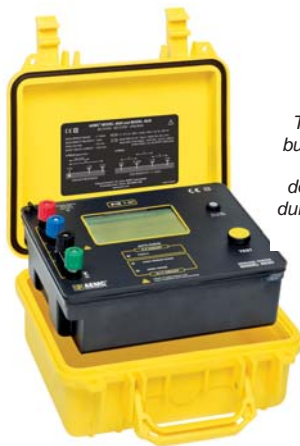
The Models 4620 and 4630 are built into a double case. This extra rugged construction provides double insulation, maximum field durability and ease of serviceability.