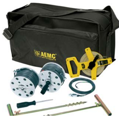
Test Kit – 3-Point includes carrying bag, two 150 ft color-coded leads on spools, two 16" auxiliary ground electrodes, one 16 ft lead with Mueller® clip and one 100 ft tape measure Catalog #2130.62