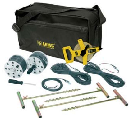
Test Kit – 4-Point includes carrying bag, two 300 ft color-coded leads on spools, two 100 ft color-coded leads, four 16" auxiliary ground electrodes, one 16 ft lead with Mueller® clip and one 100 ft tape measure Catalog #2130.63