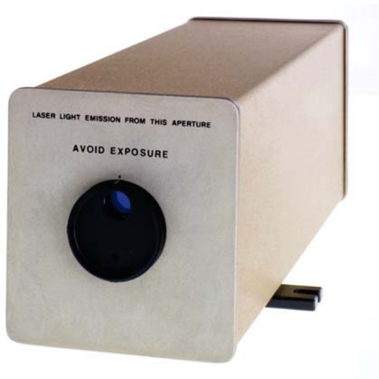
5517C Laser Head