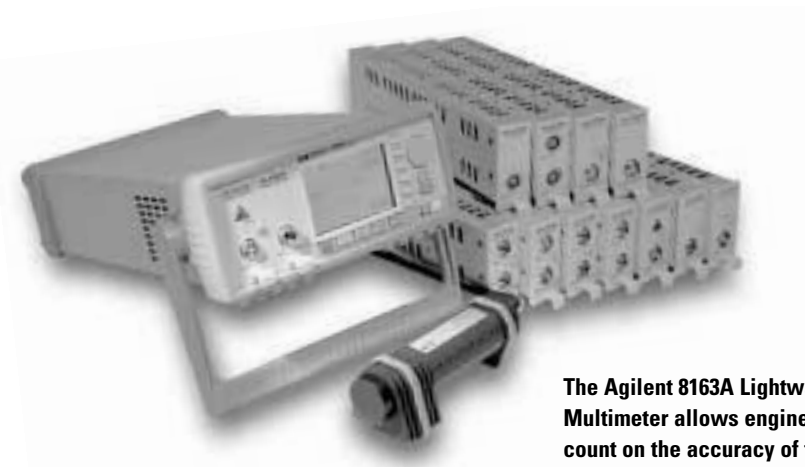
The Agilent 8163A Lightwave Multimeter allows engineers to count on the accuracy of their measurements more than ever.

In combination with a power sensor or an optical head you can setup a complete measurement system for wavelength dependent loss.