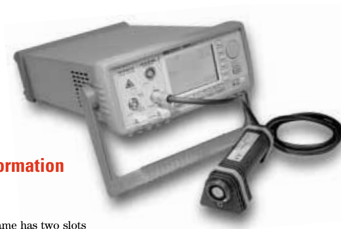
Agilent 8163A Lightwave Multimeter Stimulus Response Solution

If you want to use optical heads, you also need an interface module 81618A (single) or 81619A (dual) and you may need filter holders, filters, lenses and connector adapters.