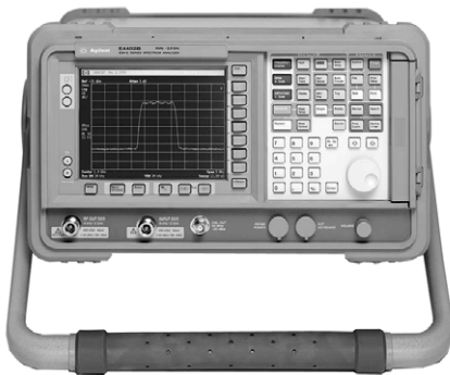
These specifications apply to the Agilent Technologies E4401B, E4402B, E4404B, E4405B, and E4407B spectrum analyzers.