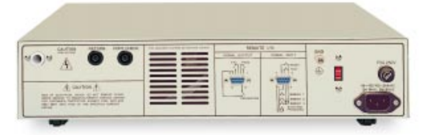
HypotPLUS® II includes rear panel high voltage and return connections and remote control connections to make it easier to build into a rack mount system.