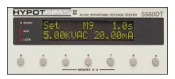
High resolution LCD clearly indicates setup parameters and test results. Single function dedicated keys speed setup without scrolling through the menu.