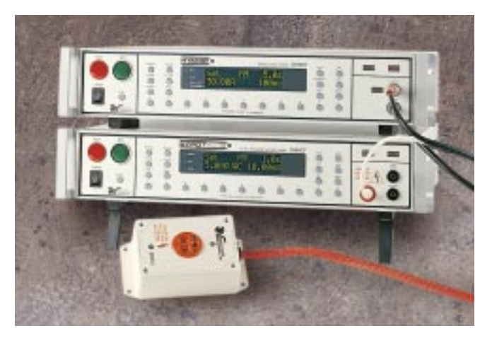
HypotPLUS® II shown with HYAMP® II and interconnecting receptacle box for testing products terminated in a line cord. Also shown are the standard rack mount handles.