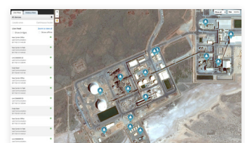
Blackline Live safety monitoring portal