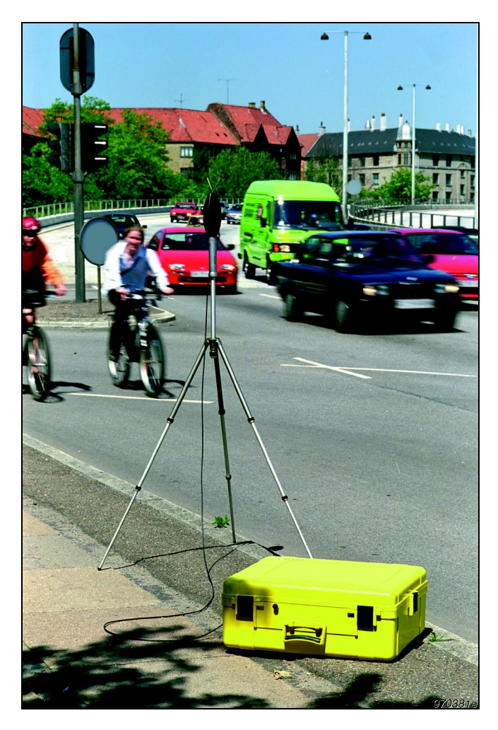
Fig. 4 Outdoor Gear Type 3592 and Outdoor Microphone Kit UA 1404

Measurements can be manually controlled, or the measurement time can be preset, in which case the results are automatically saved to a file. And the measurement can be set up to repeat 1-99 times in a sequence where each measurement is saved when finished and a new measurement is immediately started. This feature can be used to generate a sequence of periodic reports, for example, hourly reports covering 24 hours. As a matter of course this feature can be combined with the auto-start, enabling measurements to start unattended, for example, at midnight, using a specified setup.