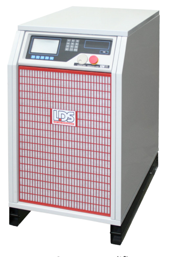
LDS HPAK Amplifier

The HPAK amplifier is a dedicated 5 kVA unit optimised for use with the LDS V650 Series and V780 Series shakers to deliver greater force than if using the LPA1000 amplifier. This compact unit delivers the power for both the shaker and field coils, as well as power for the cooling fan.