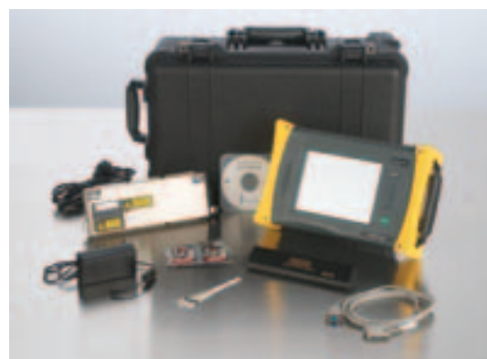
OptiVisor 400 OTDR Basic Kit | LAN638

Kits include OptiVisor 400 OTDR Mainframe with power meter, single-mode and/or multimode module with VFL, power supply, Smart NiMH battery, 9 volt battery, RS232 serial cable, CD with OTSView PC emulation software, OTSBatch PC batch processing software and user's manual, cleaning supplies, Quick Reference manual, and hard-shell transit case.