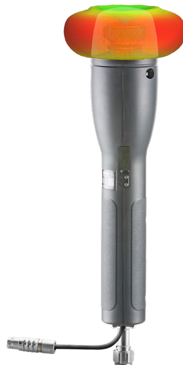
Fig. 2. 3591/02 Omnidirectional