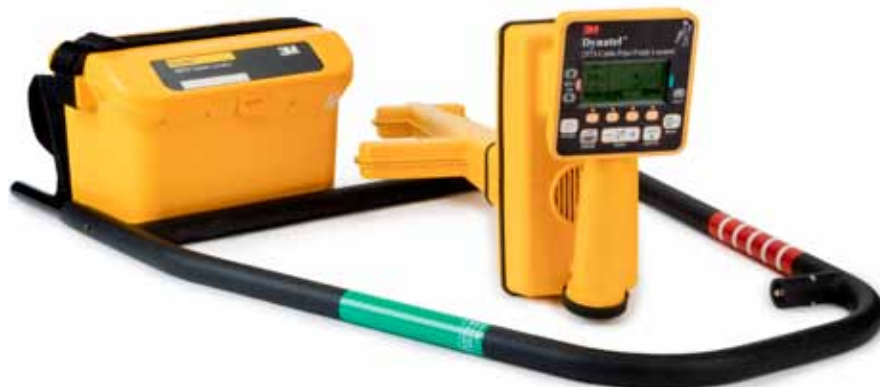
3M™ Dynatel™ Pipe/Cable Locator 2500 Series

As with all 3M™ Dynatel™ Locator products, the 2500 series provides accurate pipe, cable or Sonde depth measurements, giving a digital readout in feet and inches, or centimeters (user-selectable). Lightweight, compact and well-balanced, these cable and pipe locators allow you to accurately and easily locate your underground plant and assets. The 3M™ Dynatel™ 2550-iD and 2573-iD have the additional capability to locate all standard electronic markers and to write, read and lock programmed information into 3M™ Electronic Marker System iD Markers. All 2500 series locators and fault finders are also compatible with select GPS/GIS field mapping instruments for real time mapping of electronic markers or pipe and cable facilities. Other user friendly features include the ability to enable or disable receiver frequencies and the ability to select audio sounds in the simple menu driven interface.