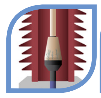
PD starts to erode insulation