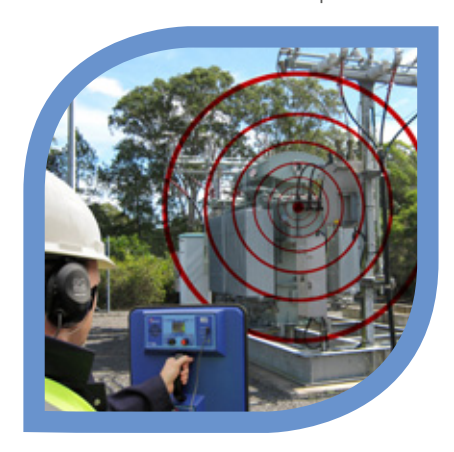
PD scanning identifies problems BEFORE they lead to failures

The first sign of problems in switchyard assets is often sudden failure, causing expensive damage and outage. The PD Hawk<sup>TM</sup> identifies problems in assets BEFORE they fail, at a fraction of the cost of a single outage.