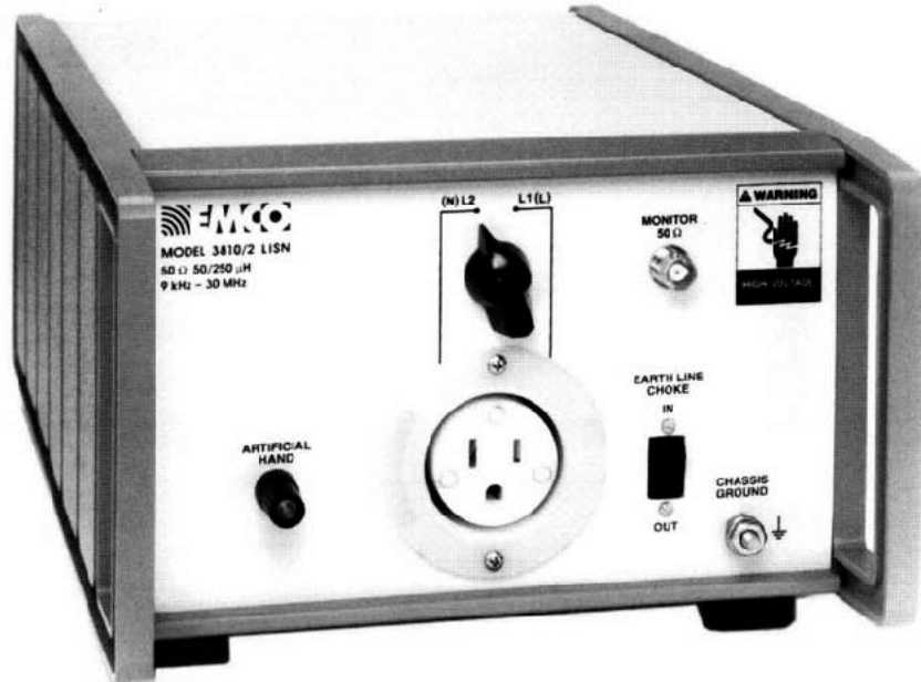
Model 3810/2 LISN

Models 3625/2, 3725/2M, 3810/2, 3816/2, 3825/2, 3850/2, 3925/2, 3701