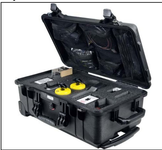
Figure 1. SCS 770045 EOS/ESD Assessment Kit