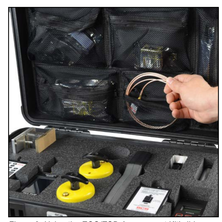
Figure 2. Using the EOS/ESD Assessment Kit's lid organizer

https://www.esda.org/standards/esda-documents/