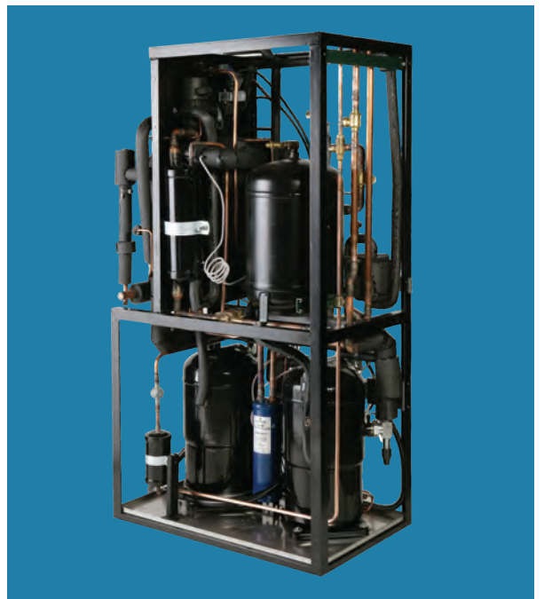
Advanced refrigeration design is especially compact for high performance test chambers.