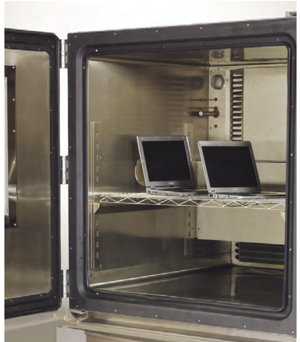
Innovative high-speed airflow suited for fast temperature cycling applications.