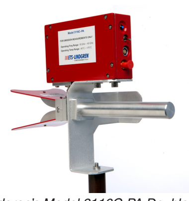
ETS-Lindgren's Model 3116C-PA Double-Ridged Waveguide Horn Antenna with Pre-Amplifier