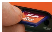
SD memory card included