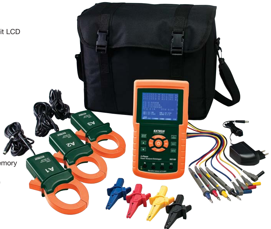
Complete with 3 current clamps, 4 voltage leads with alligator clips, 8 AA batteries, SD memory card, Universal AC adaptor (100 to 240V), and case