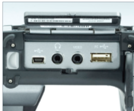
From Left to right: USB mini for PC image download, 4 pole audio for voice annotation, NTSC video, USB-A for memory stick image transfer