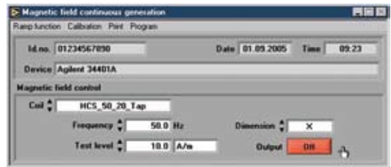
Magnetic field continuous generation window

Open the continuous generation window for long term magnetic field test.