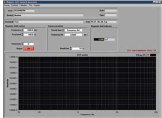
Standard generation window

Open the Magnetic field generation window for susceptibility tests according to predefined standards.