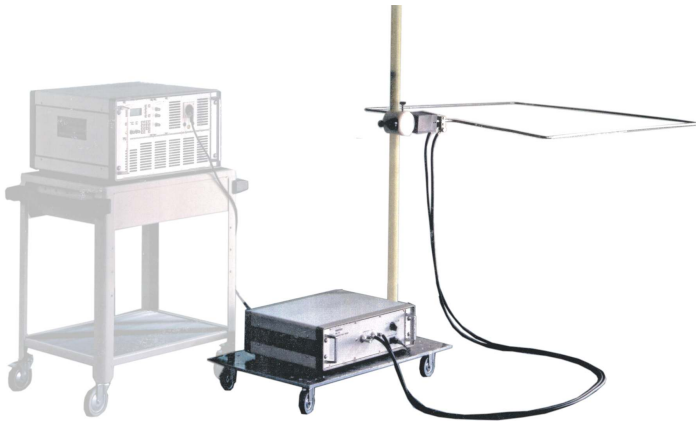
MAG 100 current transformer, 1mx1m antenna mounted on support stand (right) shown with the power source (left)

Power Frequency Magnetic Field Test Equipment