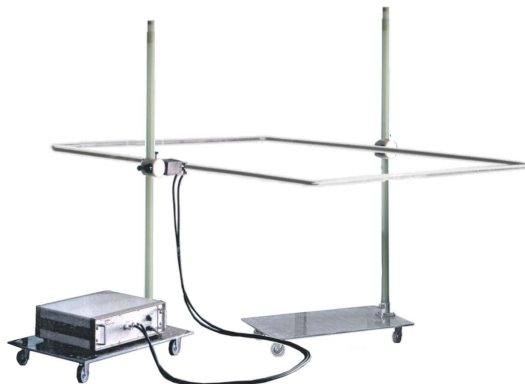
MAG 100 current transformer, 2mx2.6m antenna mounted on two support stands