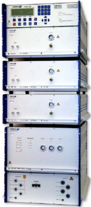
Top-down: Controller, PIM 110, PIM 400 & PIM 410 impulse modules, PCD430 coupling network

To be used for transient voltage surge suppressor testing of: