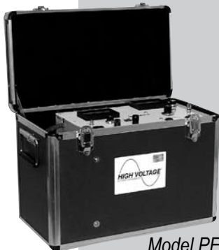
Model PFT-1003CM (0-100 kVac)