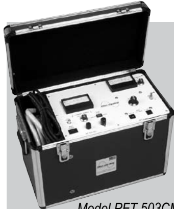
Model PFT-503CM (0-50 kVac)

0-10 kVac, 0-30 kVac, 0-50 kVac and 0-100 kVac