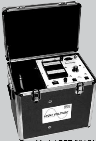
Model PFT-301CM (0-30 kVac)