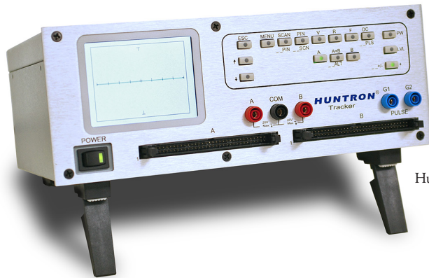
Huntron Tracker 3200S

The NEW Huntron® Tracker® 3200S is designed to encompass our product history and leadership in power-off test by providing powerful test and troubleshooting solutions.