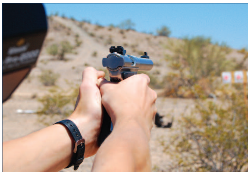
Firearms generate high dB Levels (100 – 165 dB).