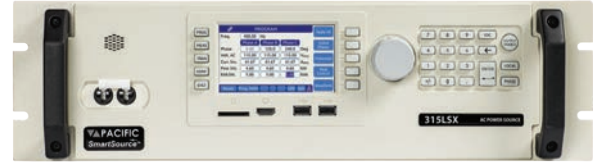
1500VA & 2000VA Three Phase Models