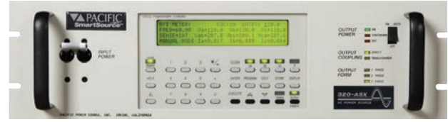
Model 320ASX - 2000VA

Pacific Power Source is pleased to announce the release of the new LSX Series of high performance PWM switch mode AC power sources. The LSX Series is a direct replacement for Pacific's legacy ASX Series but offers many enhancements and improvements over the older model generation.