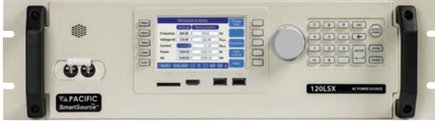
Model 320LSX - 2000VA