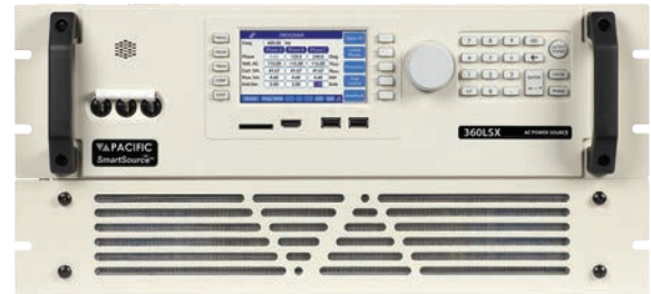
4500VA & 6000VA Three Phase Models