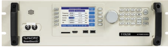
1500VA & 2000VA Single Phase Models