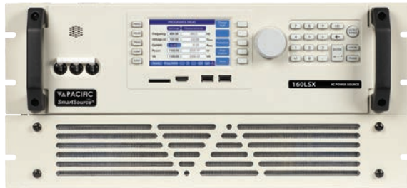
4000VA & 6000VA Single Phase Models