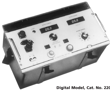
Digital Model, Cat. No. 220070