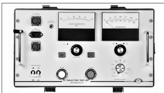
Front panel of Analog Model, Cat. No. 220124

The insulation resistance test is often referred to as a "spot check," and is performed by applying a predetermined voltage to the unit under test, holding it until the apparent leakage current becomes stable and recording the readings with adjustments for temperature. This test is especially applicable to low-capacitance units under test.