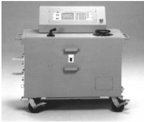
The DDA Series offers high capacity in a single, relatively compact enclosure that can be easily maneuvered.