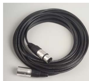
Extension cable XLR, GA-01005