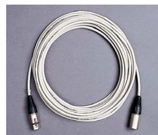
Extension cable XL, GA-00150