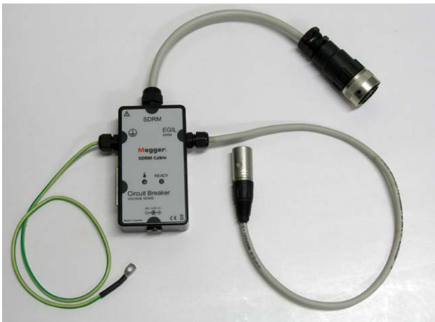
The SDRM Cable