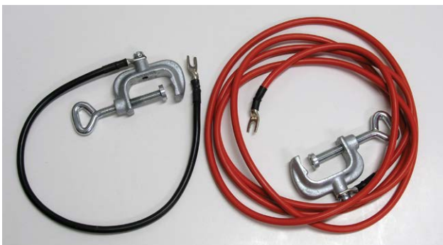
Current cables for SDRM201, the red cable is 3.0 m (9.8 ft) and the black one is 0.5 m (1.6 ft)