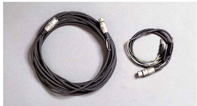
Transducer cables GA-00041 and GA-00042