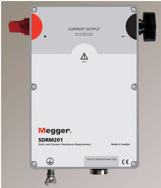
The SDRM201 is intended to use for both static and dynamic resistance measurements (SRM and DRM) on high voltage circuit breakers or other low resistive devices