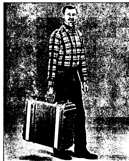
All EPOCHs (except the EPOCH-V) are housed in a rugged, polyethylene case custom-designed to withstand rugged field use.