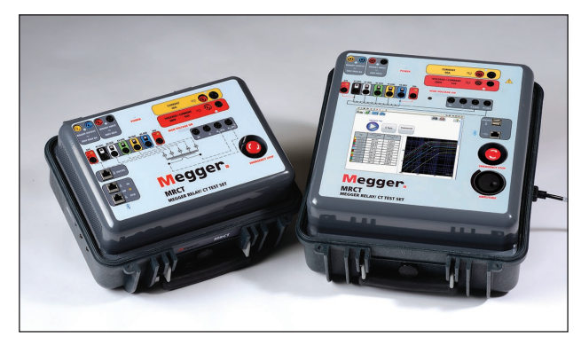
The MRCT is available in 2 onboard display/enclosure options.

■ Industry leading test duration using patented simultaneous multi tap measurements - The MRCT system can provide concurrent measurement of voltages on all taps during CT saturation, and ratio and polarity testing. This allows the MRCT system to calculate the knee points and ratios of all windings at the same time thus eliminating the need for multiple tests on a CT. This will drastically reduce testing time.