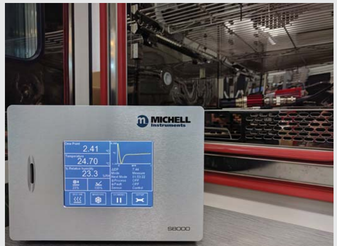
Application: Climatic chamber monitoring

For more challenging applications, where direct insertion is not possible, the sensor can be mounted in a sample block and included in a sampling system. This means that the product can be used for a wide range of applications, and with trace heating - including those up to dew-point temperatures of